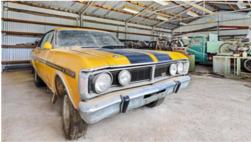
A 1971 Ford Falcon XY GT is set for auction after spending 36 years on blocks.

Some of the best examples of Australian car manufacturing are up for grabs with three rare late model Holdens and a classic Ford going under the hammer.