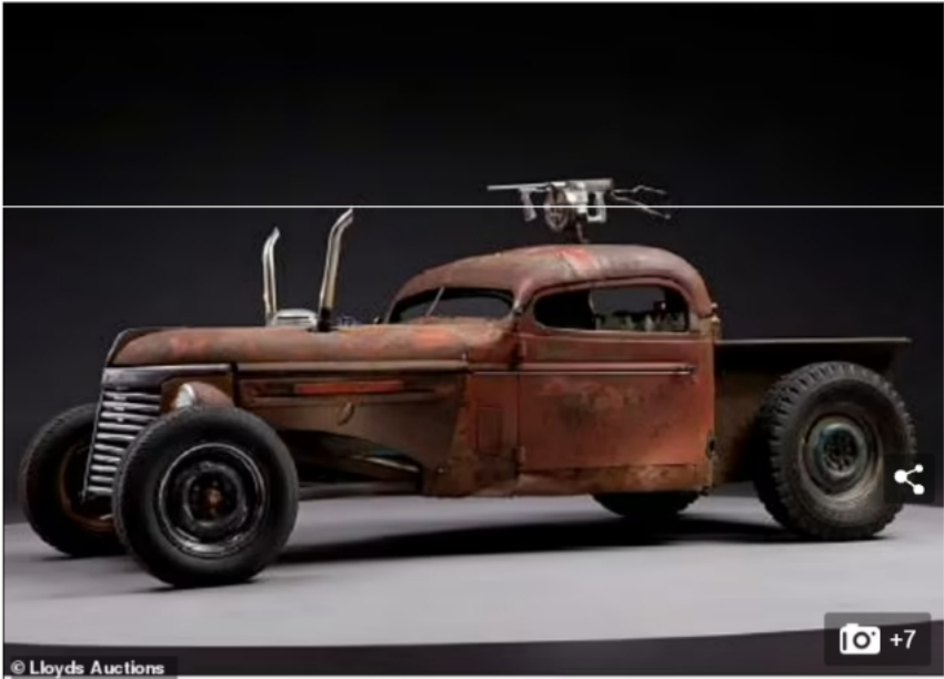
Straight from the apocalypse: The iconic movie vehicles from the 2015 hit Australian blockbuster will be available for bidding in a series of auctions held by Lloyds on the 25th and 26th of September. Pictured: Buggy: Ratrod Chev

The collection includes a total of 13 cars and trucks from the post-apocalyptic action film, most of which were operated by Immortan Joe's War Boys in the movie.