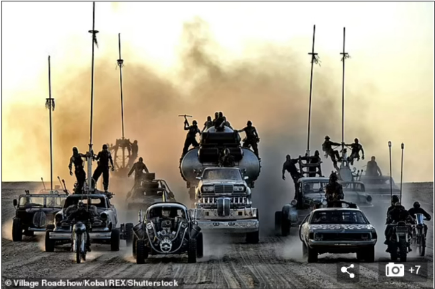
A piece of blockbuster history: Vehicles from Mad Max Fury Road including the War Rig, Doof Wagon and classic Interceptor set to be sold in a online virtual auction

The collection includes the War Rig that was driven by Tom Hardy's Max Rockatansky and Charlize Theron's Imperator Furiosa, the Doof Wagon and Max's classic Interceptor.