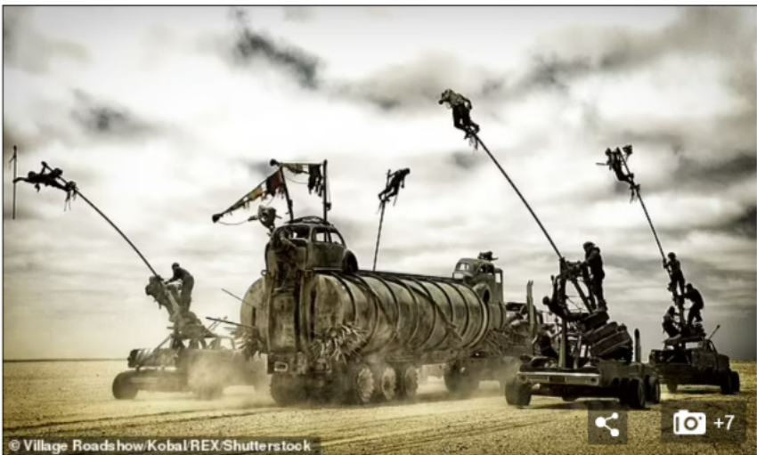
Time for a bigger garage: The collection includes the War Rig that was driven by Tom Hardy's Max Rockatansky and Charlize Theron's Imperator Furiosa, the Doof Wagon and Max's classic Interceptor