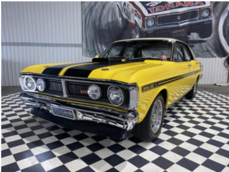
The Yellow Glo Ford GTHO Phase III Falcon sold at auction for $1.3 million.

Also being auctioned was a collection of rare Holdens which also achieved record prices.