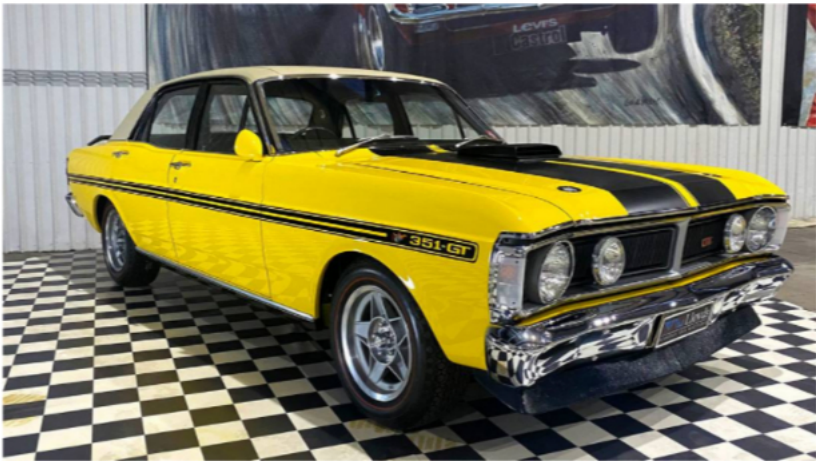
CLASSIC MUSCLE: The Ford Falcon GTHO Phase III in Yellow Glo was receiving a lot of attention across Australia and was expected to sell for a high 7-figure amount come auction day.

In a world first, Lloyds Auctions will offer NFTs alongside the sale of the "physical" classic Aussie muscle car.