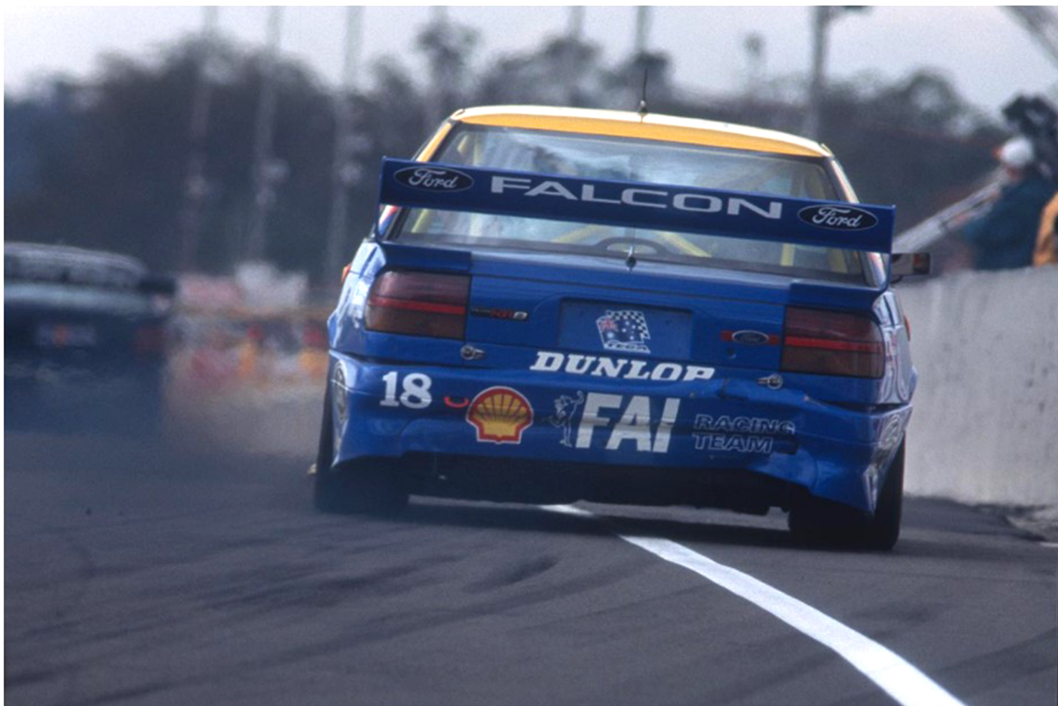
John Bowe's Ford EB Falcon pictured in 1994 sporting the same spec rear wing for auction

Established in 2015, The Motorsport Trader buys, sells and specialises in consignment sales of all things motorsport memorabilia, according to L'Huillier.