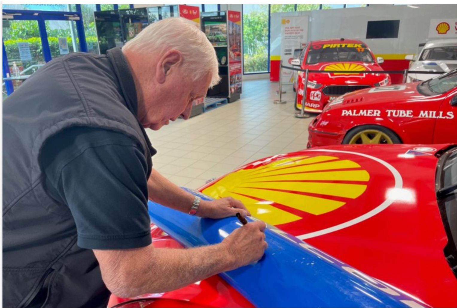
Dick Johnson signing the rear wing

All proceeds from this auction will go to Speedcafe.com's charity, Motor Racing Ministries, and fans have the opportunity to bid on the item until 19:00 AEST on Tuesday, August 10 ( CLICK HERE to bid ).