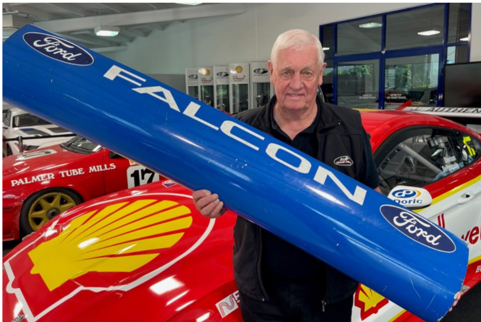
Dick Johnson and the rear wing from his 1994 Ford EB Falcon

A rare, original rear wing from Dick Johnson's Ford EB Falcon has been put up for sale through Lloyds Auctions as part of Speedcafe.com's fundraising program for Motor Racing Ministries.