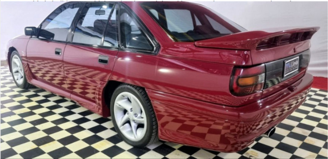
Holden and HSV only made 302 examples of the VN Group A SS

READ MORE: Hero Holdens go under the hammer