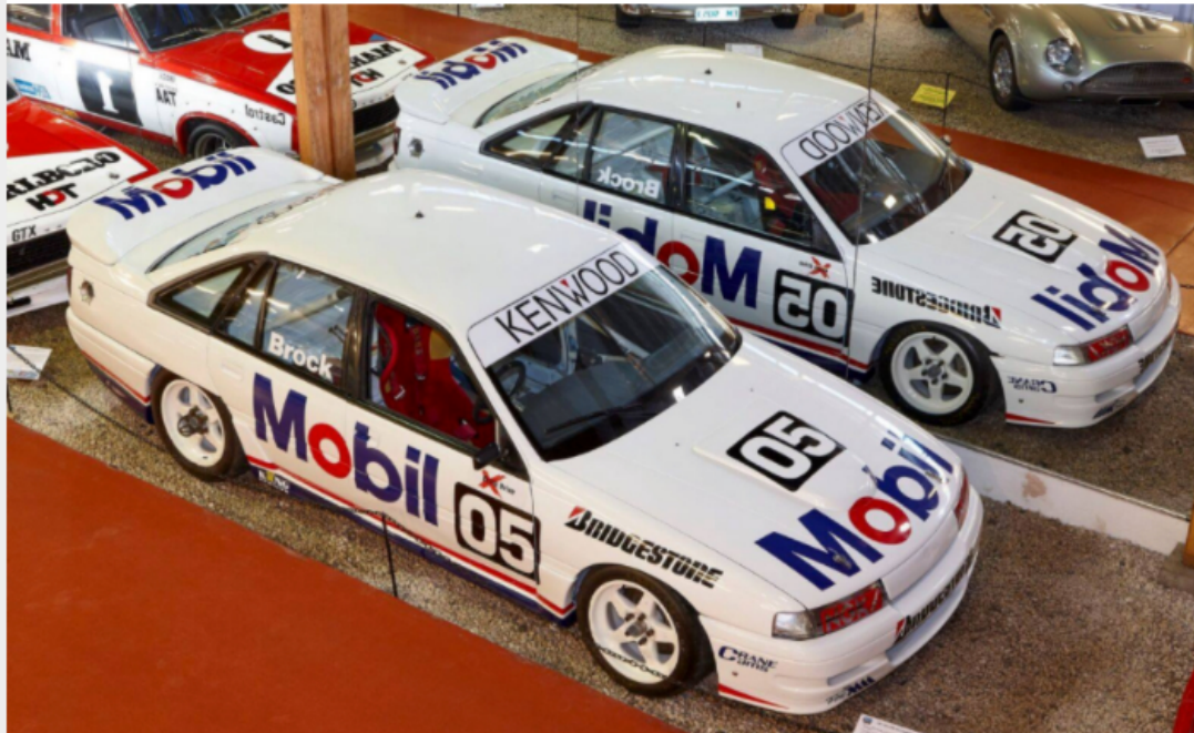
Peter Brock used the VN Group A SS during the 1991 touring car season