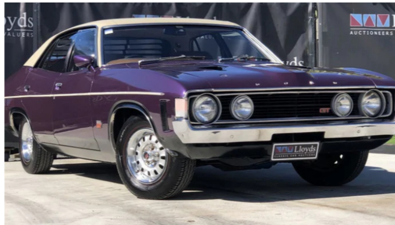
This 1973 Ford Falcon XA GT RPO 83 sedan was built in a one-of-a-kind specification.

The 1973 Ford Falcon XA GT has become a cult car after the notorious “supercar scare” of the early 1970s.